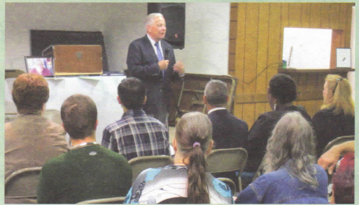
Congressman Gene Green taking questions at a veteran's town hall where new and current federal policies were discussed. Attendees also received information about veteran's benefits and services from local groups and government agencies.

The original sponsors of H.R. 6 are: Reps. Gene Green (D-TX), Fred Upton (R-MI), Diana DeGette (D-CO), Frank Pallone, Jr. (D-NJ), and Joe Pitts (R-PA).