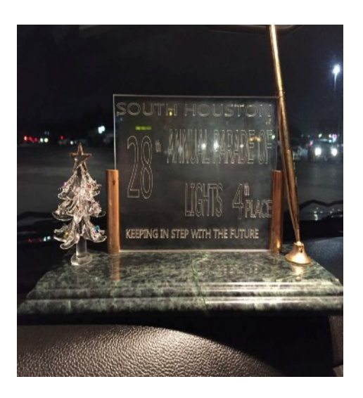
South Houston Parade of Lights 4<sup>th</sup> Place

Civic Club Meetings Feb 12<sup>th</sup> and March 12<sup>th</sup> 6:30pm Meadowcreek Village Community Center Meadowcreek Village residents and their guests are invited.